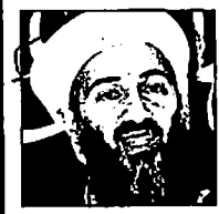
Bin Laden... terror chief